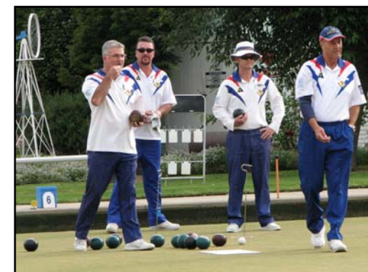
A great site. An all Camden Final in the District State Pairs